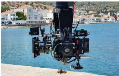
Camera view from first day of filming Glass Onion: A Knives out Mystery , by Rian Johnson. Spetses, Greece. © Rian Johnson.

Greece is an incomparable natural set, diverse, accessible, and above all friendly. It offers a variety of options that serve your story. Magnificent coastlines, sand dunes, waterfalls, snow capped mountains, tropical forests, ancient sites, historical monuments, industrial buildings, urban, rural, ancient, medieval, classical, modern: one of the richest cultural heritages in the world! All easy to reach within one hour drive from coast to mountain. Add to all the above the well-known traditional Greek hospitality and one of the best financing schemes in Europe administered by EKOME, and you have your perfect location!