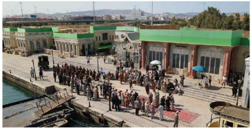
Crowd scene from Smyrna , by Grigoris Karantinakis. Attica, Greece.

GREECE HAS BECOME A TOP GLOBAL FILMING DESTINATION IN A VERY SHORT TIME, THANKS TO ITS UNIQUE LOCATIONS, COMPETITIVE INCENTIVES, SKILLED PROFESSIONALS AND NETWORK OF FILM OFFICES.