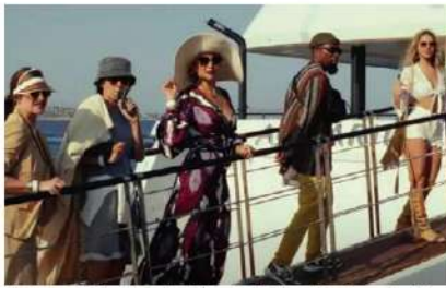
Kathryn Hahn, Jessica Henwick, Kate Hudson, Leslie Odom Jr, Madelyn Cline (l to r) in Glass Onion: A Knives out Mystery, by Rian Johnson. Spetses, Greece.